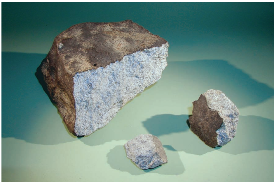
Above The Agen H5 meteorite is a typical ordinary chondrite. It fell in France in 1814. The interior is gray while the outer surface was burned with a black fusion crust by its rapid descent through the Earth’s atmosphere. The crust has since turned brown by reactions with Earth’s moist atmosphere.

But then I had my own eureka moment over a cup of cappuccino. Every morning at ten o’clock, all work stops