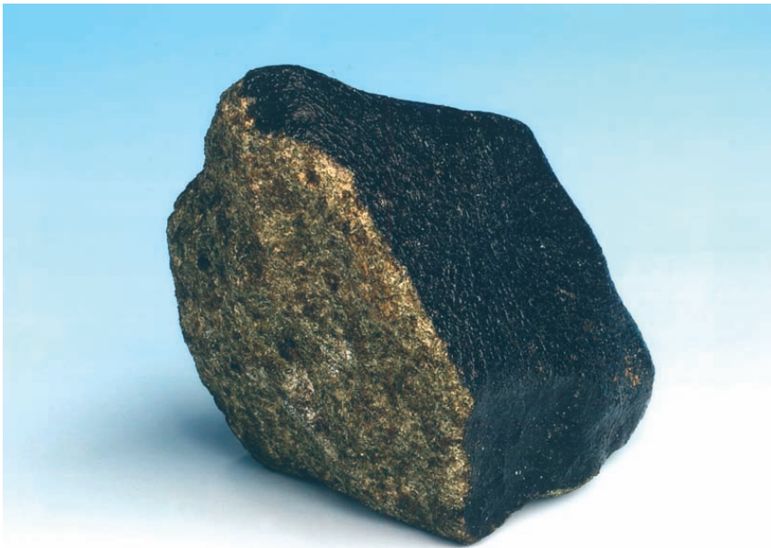
Above A formal portrait of the Martian meteorite that fell near the Egyptian town of Nakhla in 1911.

But such experiments require expensive and complicated equipment – and a trained staff of technicians to keep it all operating properly. When I arrived at the Vatican Observatory in 1993, I realized that we could never duplicate such a lab and stay anywhere within our budget! Besides, those experiments were already well underway in other labs around the world. What I needed to do was to find a range of experiments suitable to the nature of our collection and our limited resources.