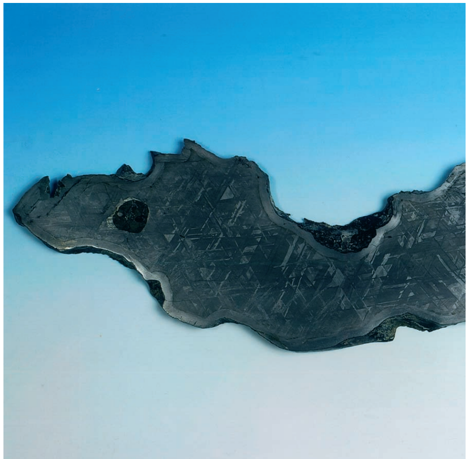
Above Iron meteorites, like this large slice of San Francisco Mountains, show a complex crystal pattern when etched with acid. The crystals indicate the high nickel content in the metal.

We compared the different ways of measuring meteorite porosity. "The trouble with using water isn't just the contamination," he pointed out. "Rocks like meteorites can be riddled with cracks and other pore spaces. The water gets into some of those spaces, but you never know just how much of the pores spaces get filled. So I was talking to a geologist working on measuring the density of core samples.