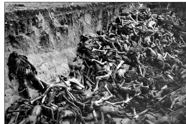
Mass grave of typhus victims in Bergen-Belsen concentration camp. Picture taken by British troops in spring of 1945.