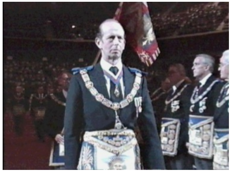
Note the Masonic apron, which is always made of lamb's skin, a blasphemous parody of the Lamb (Christ).